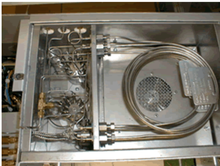
the two 10 port micro valves, the two TCD-detectors and the column oven with the two stripper columns and two analytical columns.

For this our instrument is the ideal choice: our instruments are not only designed for the analyst in the laboratory, but especially for the technician working at a control panel. Specialised analytical knowledge is not necessary. The instrument can be adapted to the measurement of other special mixtures, with inorganic compounds.