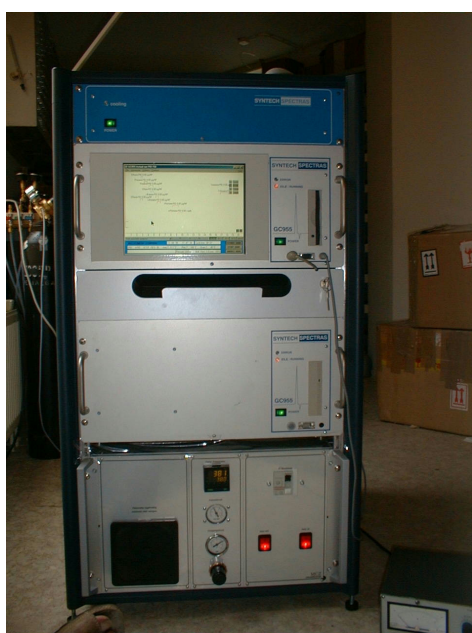
Complete installation for an ozone precursor instrument, two gaschromatographs, including gas supply